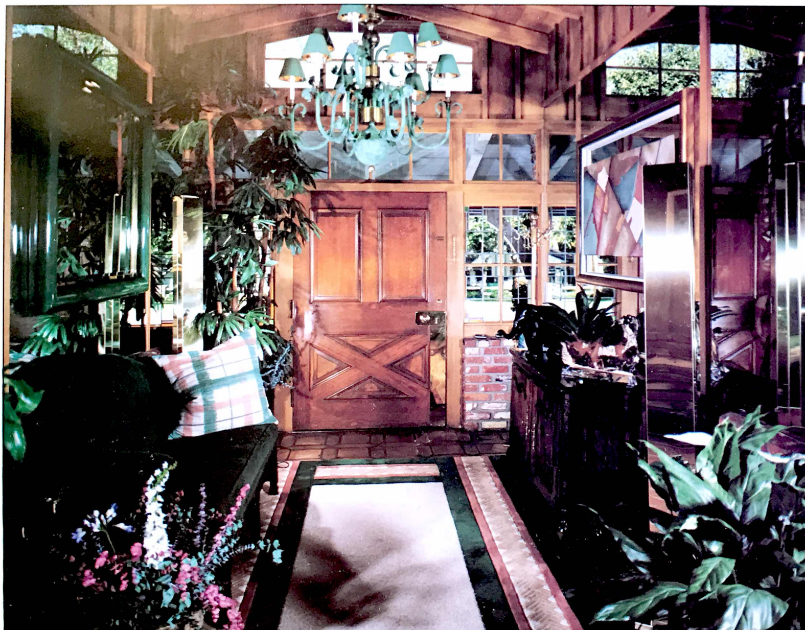
ENTRANCE - MAIN RESIDENCE

Gleaming accents of brass, mirror, leaded glass and polished hardwood create an ambience of sophisticated comfort.