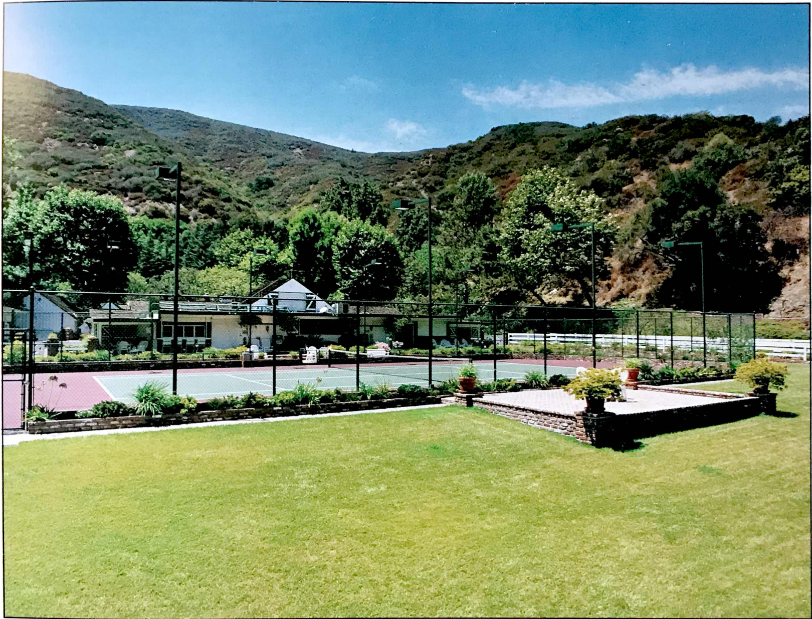
NORTH/SOUTH LIGHTED CHAMPIONSHIP TENNIS COURT WITH THE OFFICE/RECREATIONAL COMPLEX IN THE BACKGROUND