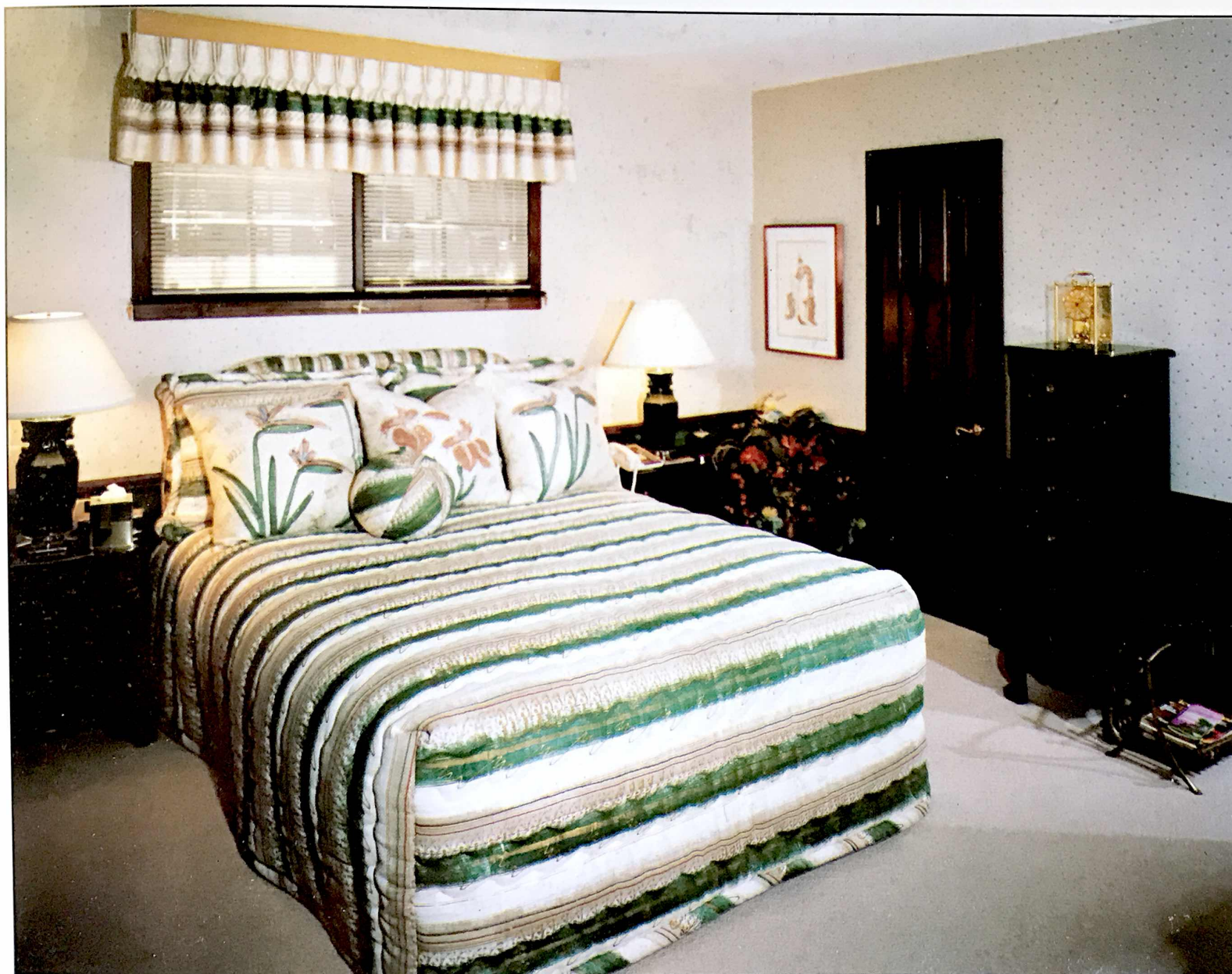
GUEST BEDROOM - MAIN RESIDENCE