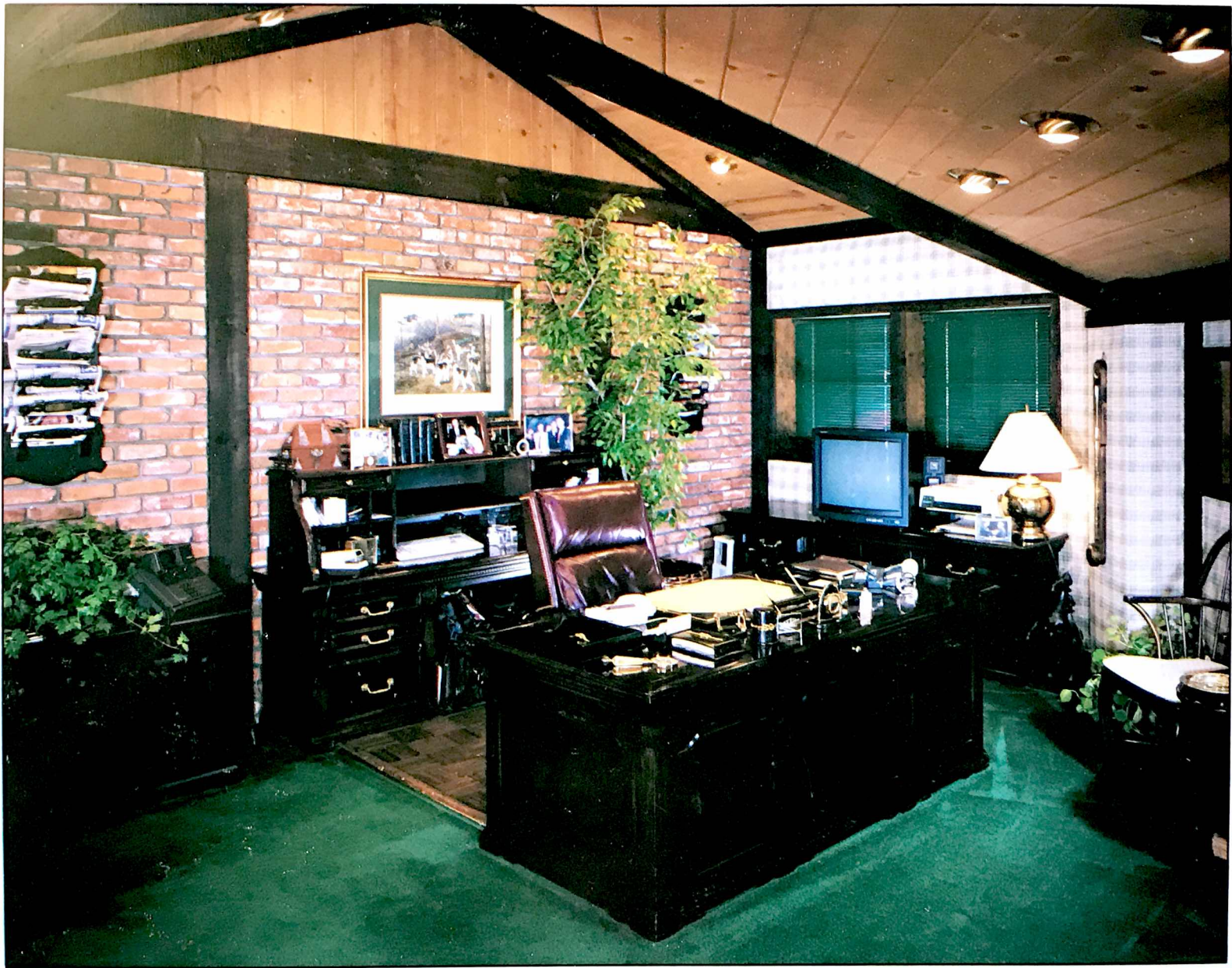
EXECUTIVE OFFICE - OFFICE/RECREATIONAL COMPLEX