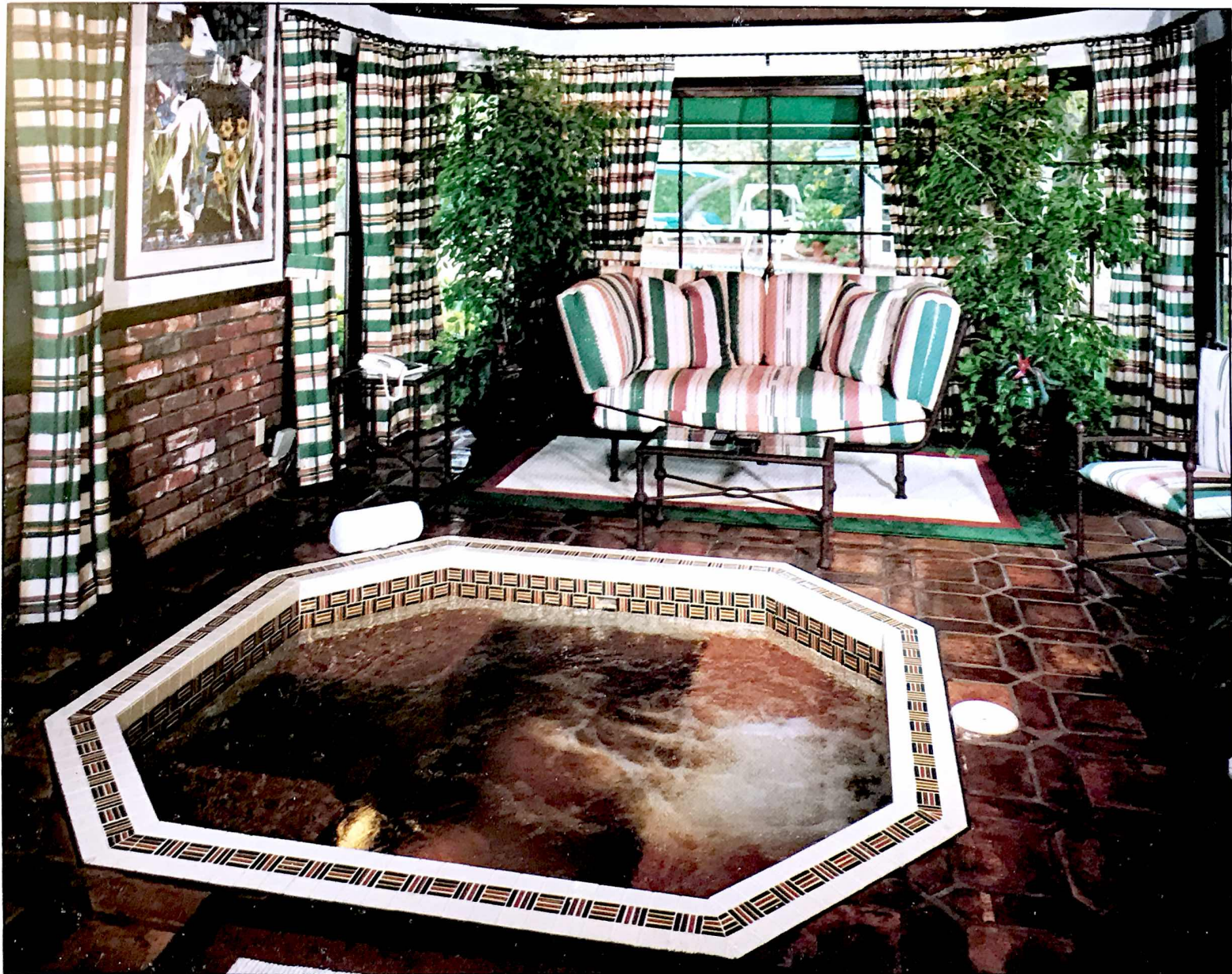
JACUZZI ROOM IN MASTER SUITE