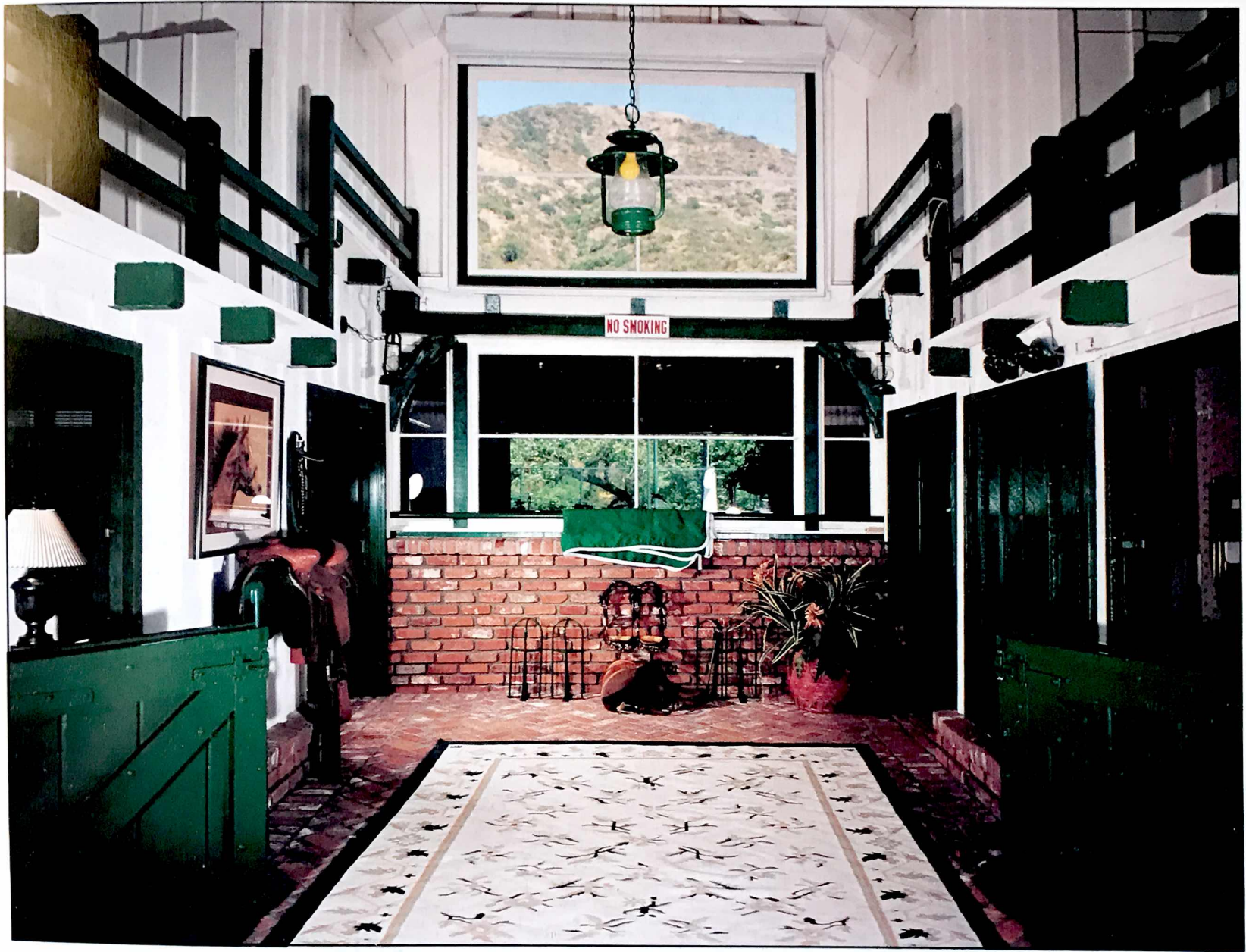
RECEPTION AREA - OFFICE/RECREATIONAL COMPLEX