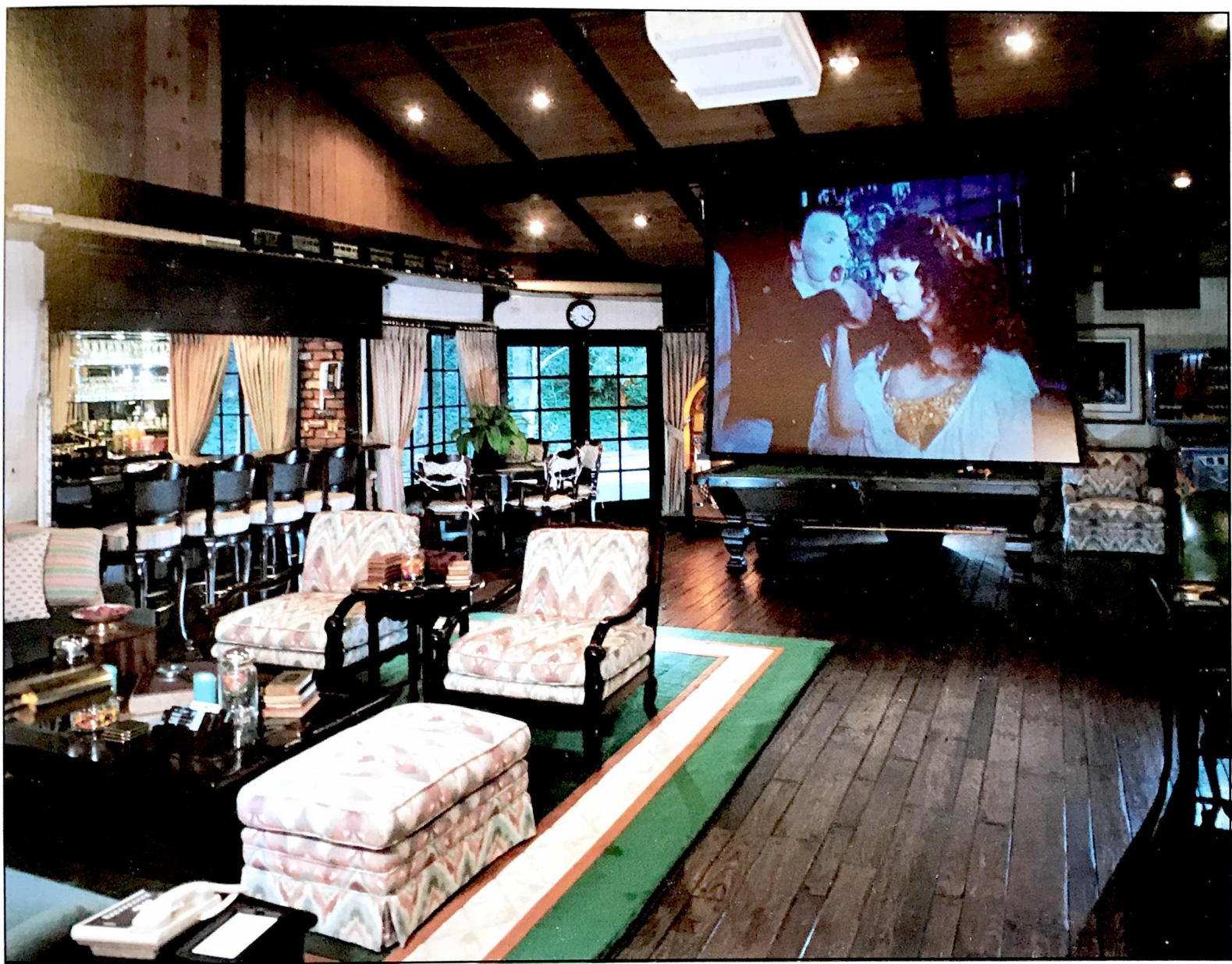
SCREENING ROOM IN USE