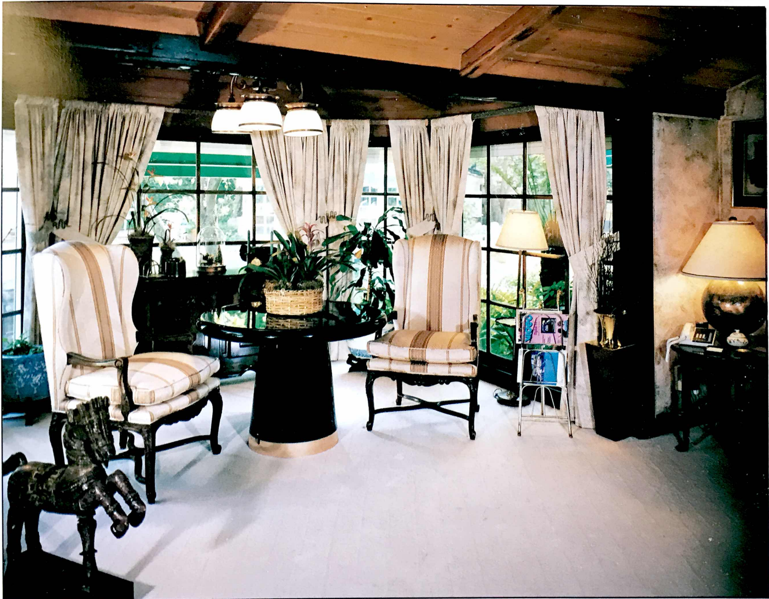
MASTER SUITE SITTING & BREAKFAST AREA