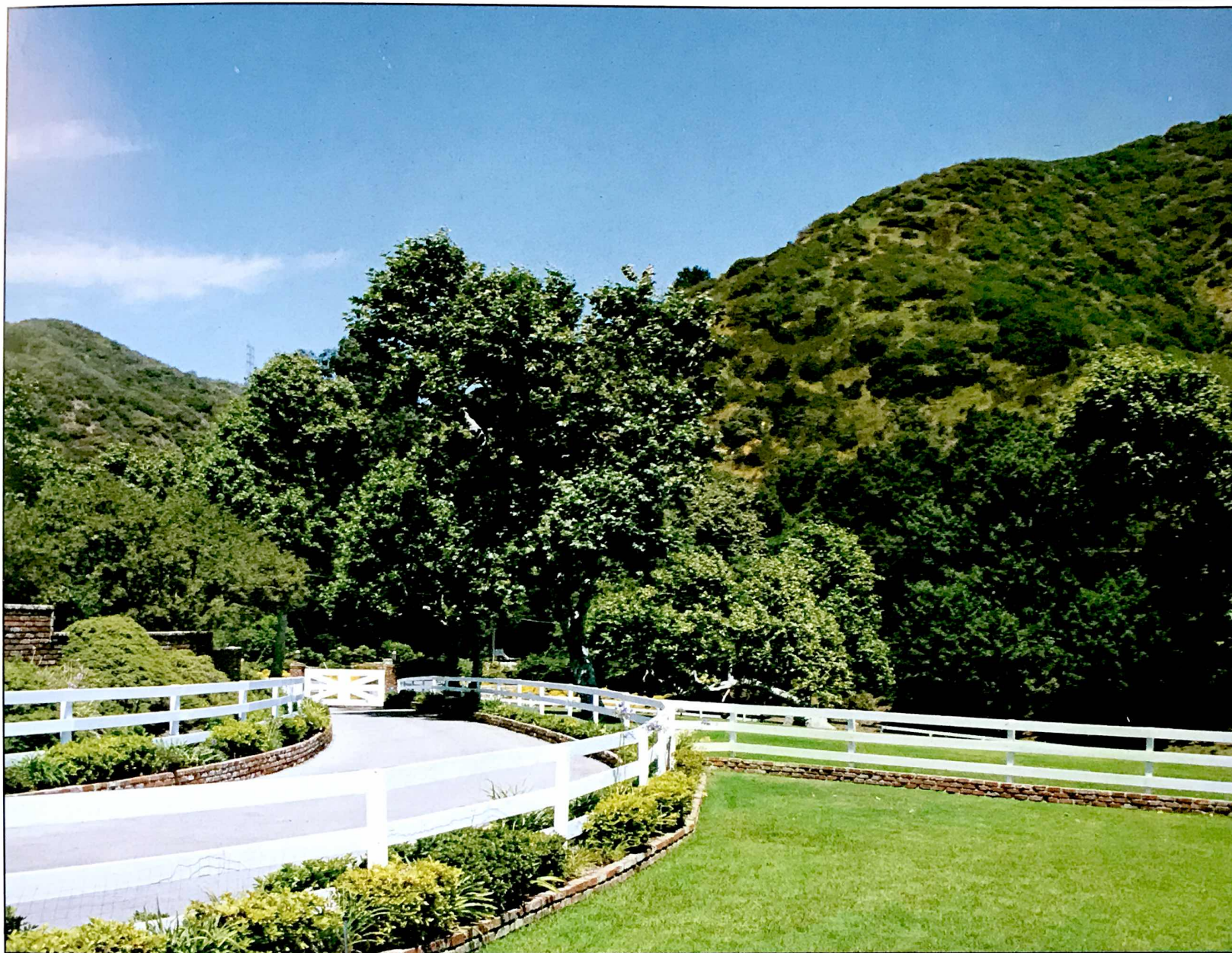
EXIT FROM THE RANCH TO MANDEVILLE CANYON FRAMED BY LUSH ROLLING PASTURES