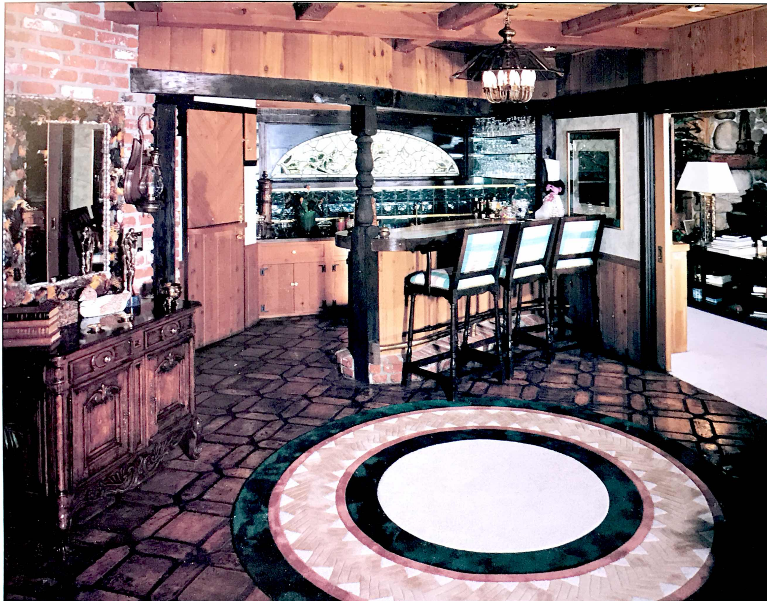
BAR - MAIN RESIDENCE

Adjacent to the living room, this professionally equipped wet bar also has a wine closet and pantry.